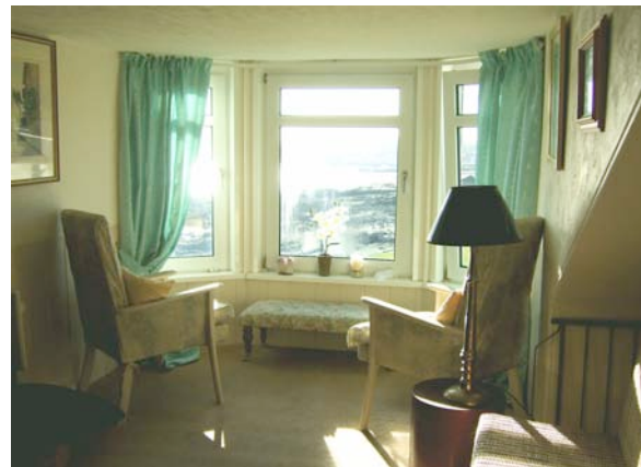
UPPER LOUNGE/BEDROOM 3