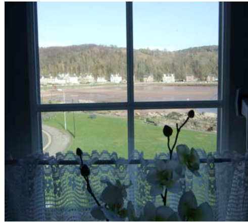
VIEW FROM KITCHEN WINDOW