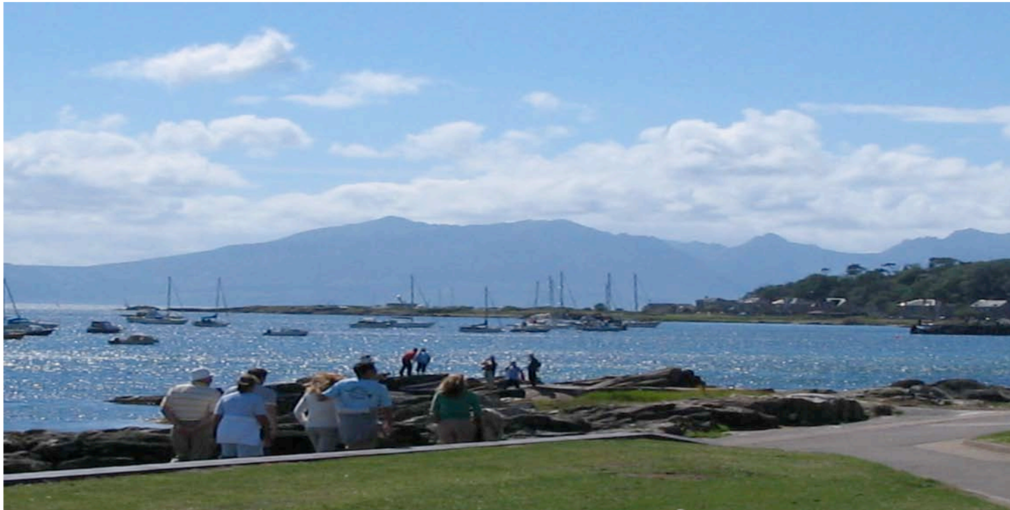
VIEW FROM THE CROSSHOUSE

FOUR B CROSSHOUSE MILLPORT, ISLE OF CUMBRAE AVAILABLE FOR HOLIDAY LETS AND SHORT BREAKS