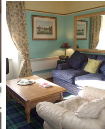
FIRST FLOOR LOUNGE

SECOND FLOOR: SMALL BATHROOM, TWIN BEDDED ROOM AND SECOND LOUNGE (OR THIRD BEDROOM - WITH A LIGNE ROSE DESIGN EXTREMELY COMFORTABLE SOFA BED).